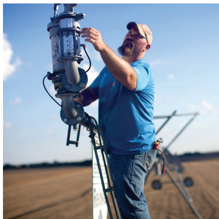
Reinke Certified Dealer

From the materials we use, to the innovative products we build, all backed by the best warranties is what makes the Reinke Difference.