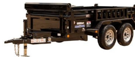
Load Trail Tandem Axle Dump trailer

To find your perfect trailer, go to loadtrail.com or visit Holdrege Trailer Sales in Holdrege, Nebraska.